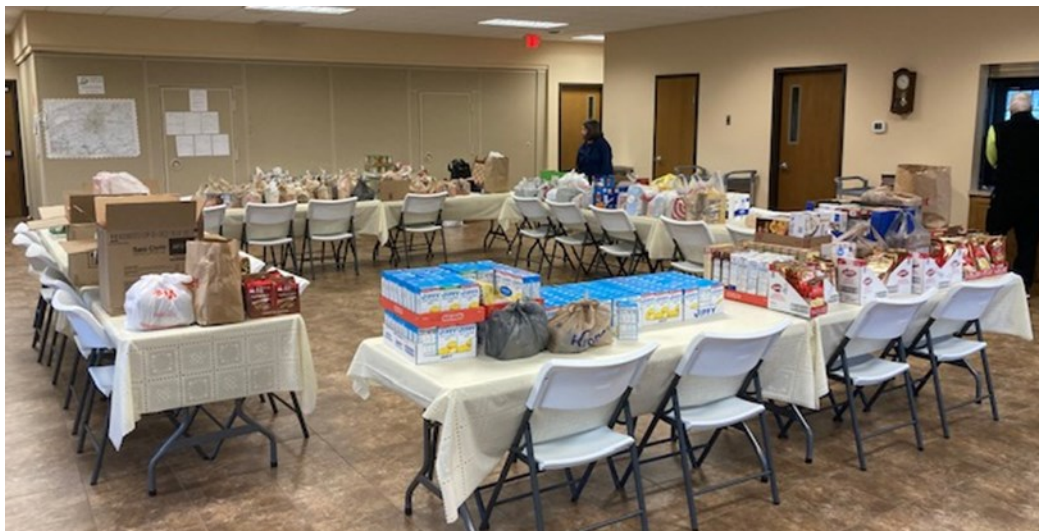
Food collection at Fairfield for Cunot Thanksgiving Dinners

As one of many causes supported by Fairfield, our Meeting's generosity delivers on the Quaker promise to relieve pain, enrich lives, and demonstrate to others that our caring attitude extends well beyond the walls of our Meetinghouse in Camby.