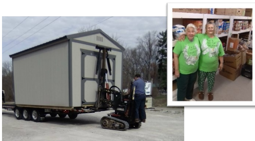
Cunot Food Storage Shed being delivered

Recently, when an emergency need arose for Cunot to have a new place to store foods, Fairfield came to the rescue with a special campaign where $3,400 was raised in 2 weeks so that Cunot could buy a new storage shed.